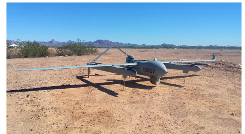
Textron Systems' skilled operators and maintainers provide turnkey FFS operations around the world.