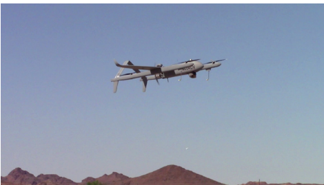
The Aerosonde HQ adds to the proven system's SWAP advantage with VTOL capability.