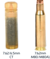
7.62mm M80/M80A1 7.62/6.5mm CT