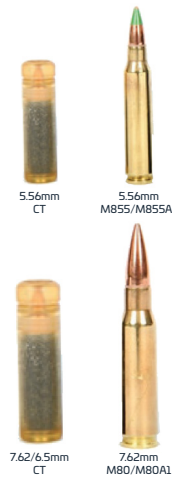
5.56mm CT 5.56mm M855/M855A1