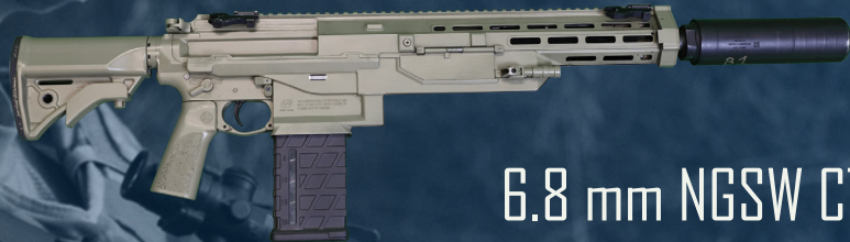
6.8 mm NGSW CT RIFLE