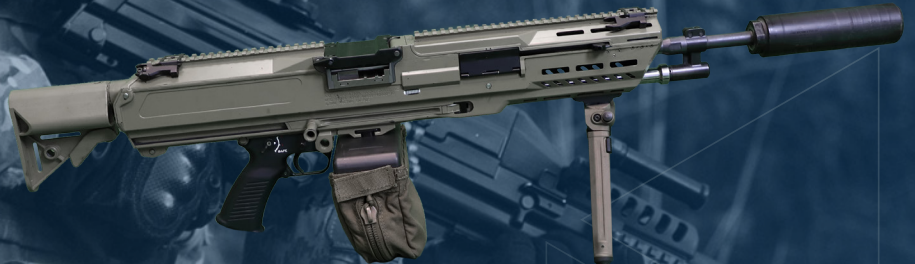
6.8 mm NGSW CT AUTOMATIC RIFLE