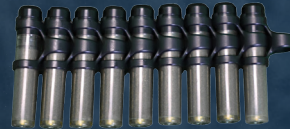
6.8 mm CT AMMUNITION