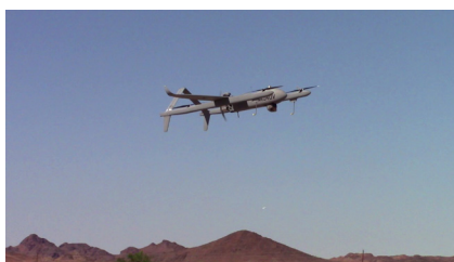
The Aerosonde HQ adds to the proven system's SWAP advantage with VTOL capability.