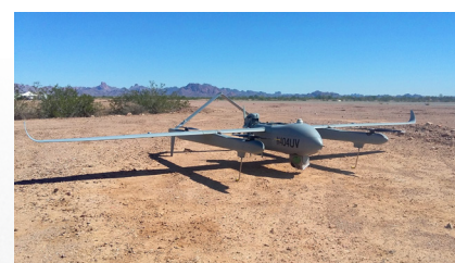
Textron Systems' skilled operators and maintainers provide turnkey FFS operations around the world.