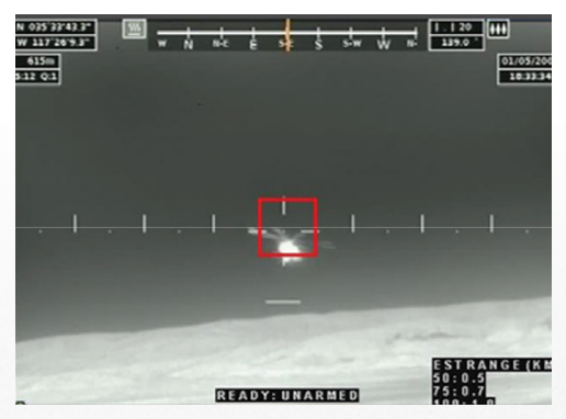
The MAST system records video of the training event for after-action review and playback.